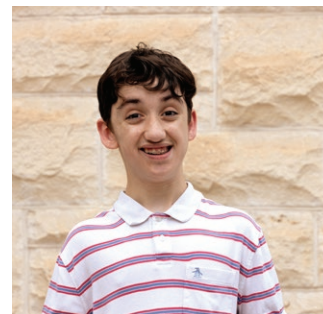
Robert Thompson Bush Middle School