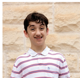
Robert Thompson Bush Middle School