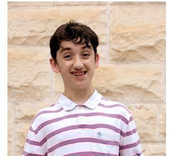
Robert Thompson Bush Middle School