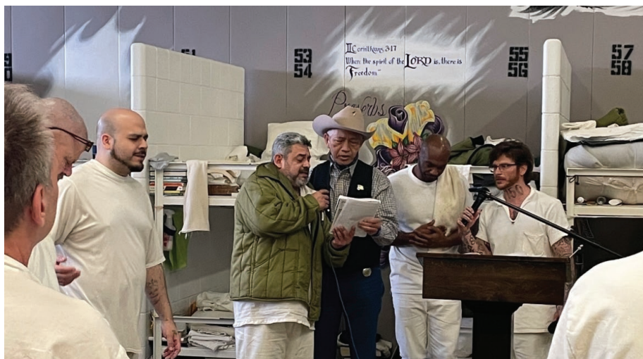
Where the Spirit of the Lord is, there is freedom. -2 Corinthians 3:17