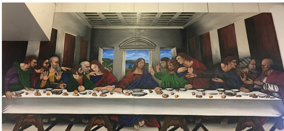
For God so loved the world... -John 3:16. Those who walk with the wise, shall be wise. -Proverbs 13:20.