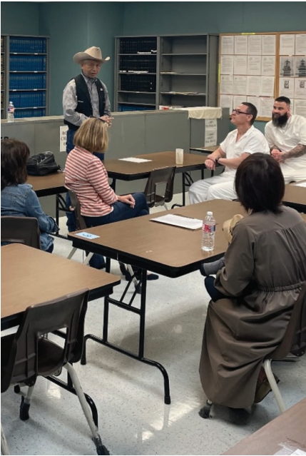
It is more blessed to give than to receive. -Acts 20:35

in this place for all to receive and rest in Him.