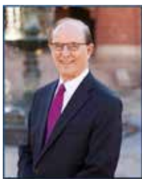
Nelson Wolff Bexar County Judge