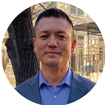
Lt. Col Shunei Tamura