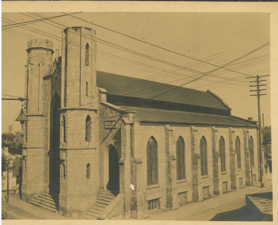
Houston & Flores St. location exterior