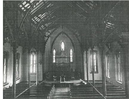
Houston & Flores St. location interior after completion in 1879.