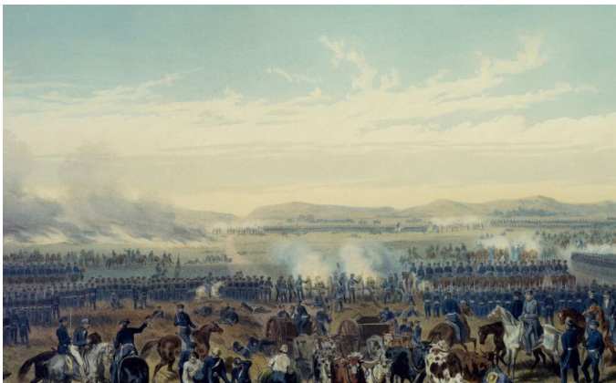
The Battle of Palo Alto was the first major battle of the Mexican–American War, fought on May 8, 1846, near modern-day Brownsville. A force of some 3,700 Mexican troops engaged a force of approximately 2,300 United States troops led by General Zachary Taylor. (Source: Wikipedia)

there...During the stay, many had been sick. I visited them there and attended a funeral almost every day, sometimes two in a day. While the Army lay at San Antonio I preached once a day to the soldiers stationed about two miles up the river near the Springs.