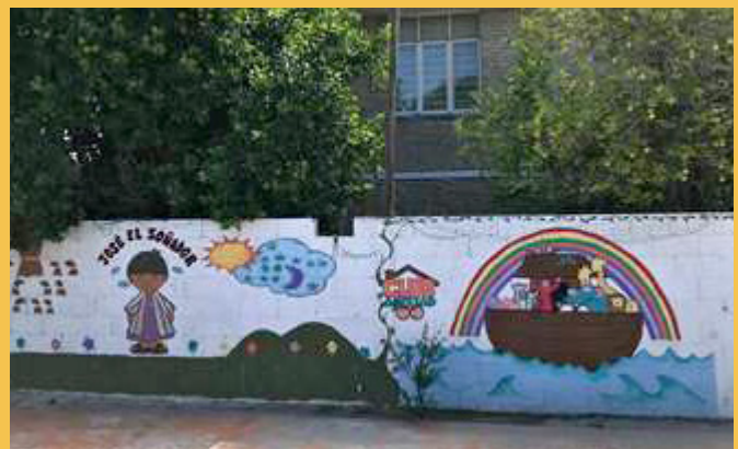
Club Amistad mural