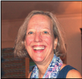
Lellen Lane Presbyterian Children’s Home