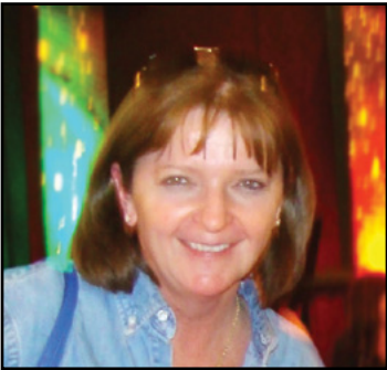
Bunkie Shed Circle 20 Service Circle