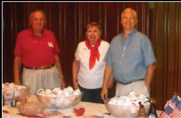
2015 ALL-CHURCH 4TH OF JULY PICNIC