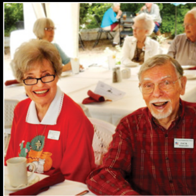
MAY 20 BOTANICAL GARDENS BIRTHDAY LUNCH