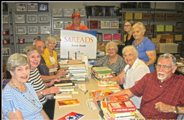
2015 SA READS