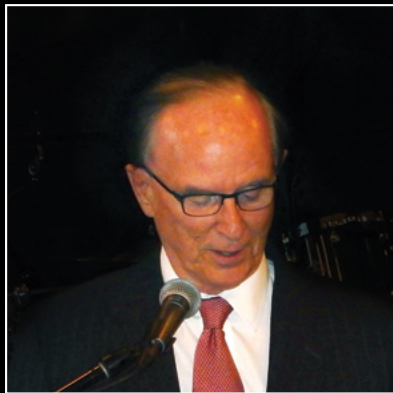
MAY 13 JUDGE NELSON WOLFF