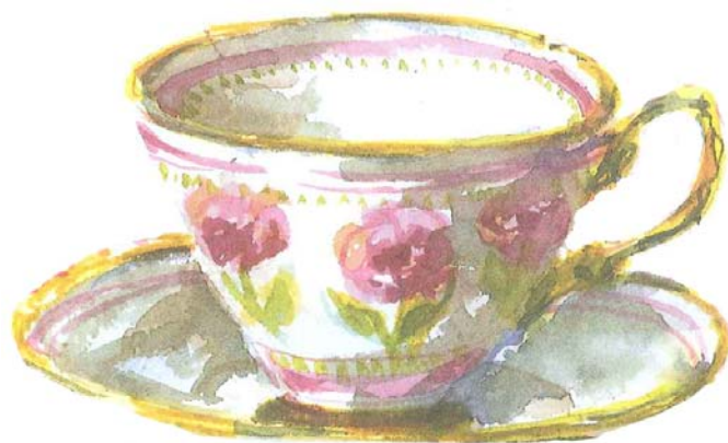
PW Annual Birthday Coffee Thursday, May 2nd 10:30am - 12:30pm

Look for specifically marked offering envelopes in the pews in the sanctuary or at the Coffee itself. Please join us for this wonderful time of fellowship and celebration of our many blessings.