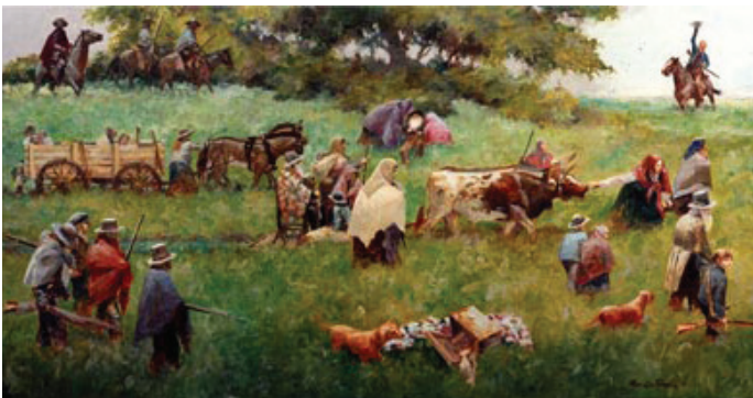
The Runaway Scrape. Courtesy of the San Jacinto Museum of History. Image available on the Internet and included in accordance with Title 17 U.S.C. Section 107.

https://commons.wikimedia.org/w/index.php?curid=3081166