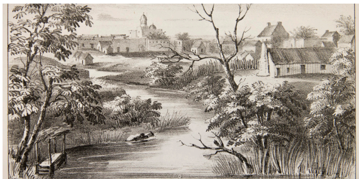
One of the earliest known sketches of San Antonio and the San Antonio River, circa 1846, possibly drawn near present Villita Street, looking west, northwestward.